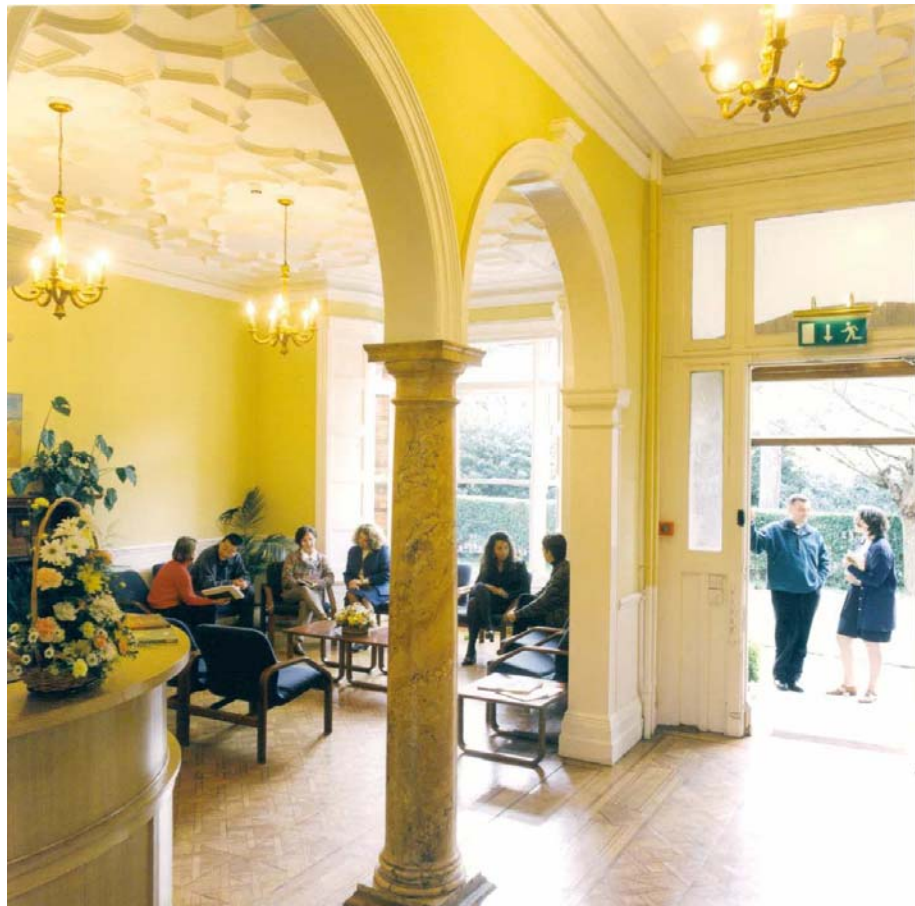
The reception area of the school

The school is located in an elegant Victorian building with its own private internal garden, situated in a charming residential area of the city with easy access to the centre of Dublin. You have access to an excellent range of didactic facilities that will help you make the most of your course and learning experience. The classrooms are fitted with audiovisual equipment and the multimedia laboratory gives you access to a range of video simulations and additional learning activities. The library contains books and materials to help you improve your business English and for enjoyment. The student lounge provides an ideal setting to relax between lessons with a newspaper and a nice cup of coffee or tea.